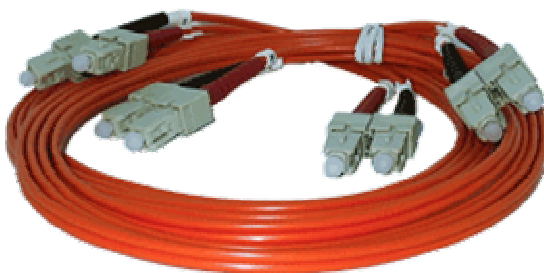
2 x 2m Duplex Fiber Cables