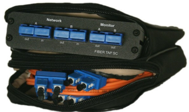
Dual compartment zipper pouch

Profitap HQ B.V. High Tech Campus 9 5656 AE Eindhoven The Netherlands +31 (0) 40 782 0880 www.profitap.com